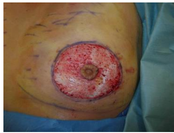
Areola resized and surrounding skin removed