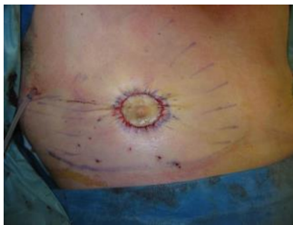
Purse string closure of skin to smaller nipple