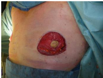
Breast tissue now gone