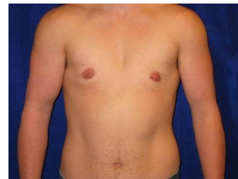
3 months post-op

Some small breasted patients can have an even more limited procedure where only a partial incision is made around the areola. This ensures the blood supply to the nipple but does nothing to take up any loose skin that may result from the subcutaneous mastectomy. I recommend this only for very small breasted patients with good elastic skin tone. If done on the right patient, the results can be excellent. The example below is liposuction in combination with subcutaneous mastectomy via a partial areolar incision from the 4-8 o'clock position around the nipple