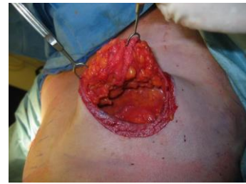
Subcutaneous mastectomy performed