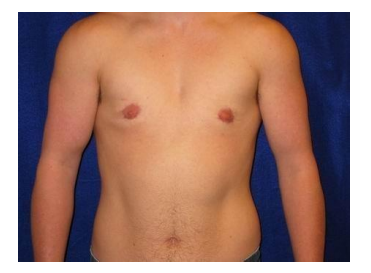
3 months post-op

Purse string closure of skin to smaller nipple