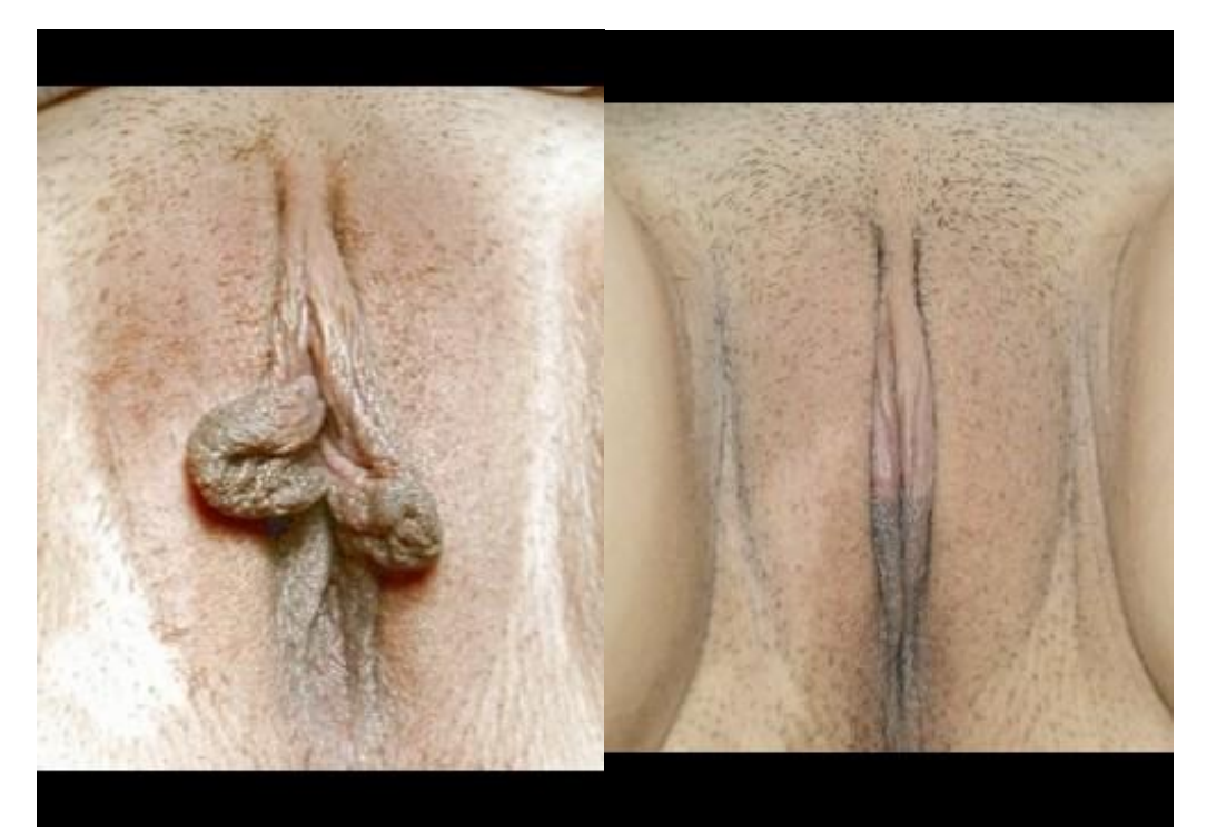
Labiaplasty before and after