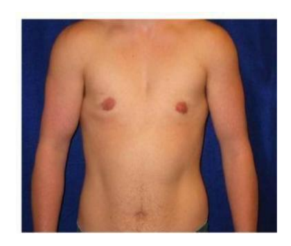
Breast tissue now gone