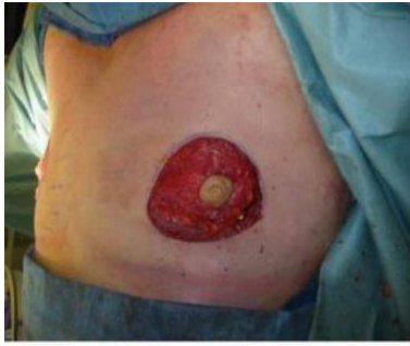
Breast tissue now gone