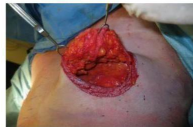
Subcutaneous mastectomy performed