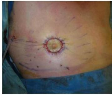
Purse string closure of skin to smaller nipple