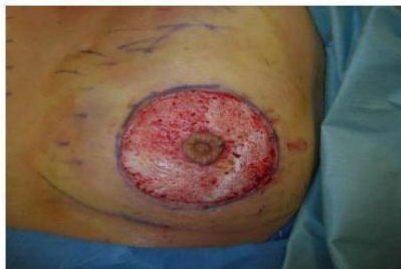
Areola resized and surrounding skin removed